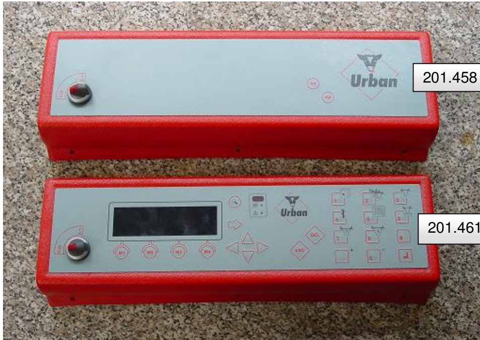
201.458 / S.52